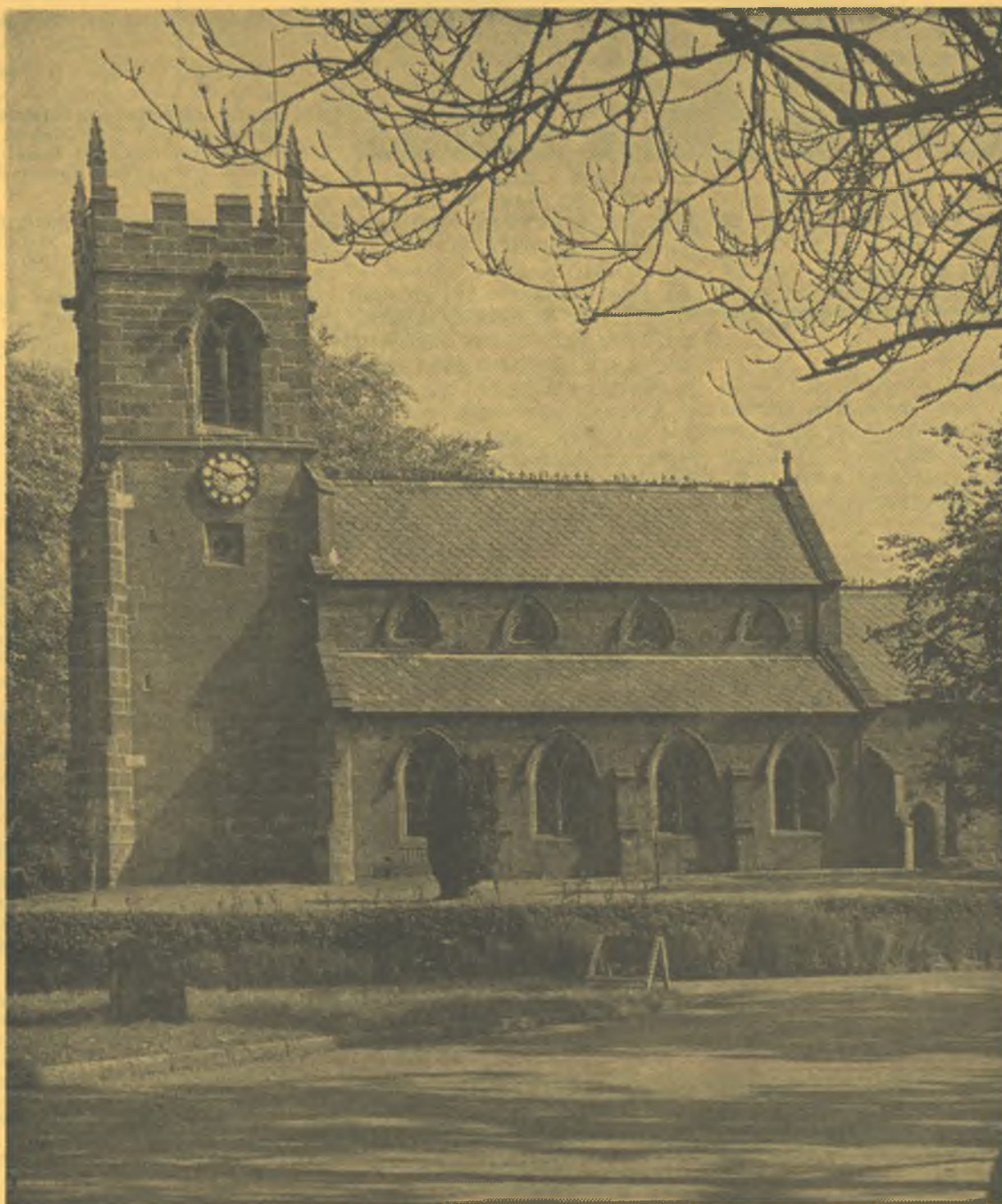
St. Chad's Church, Norton-in-Hales, Salop