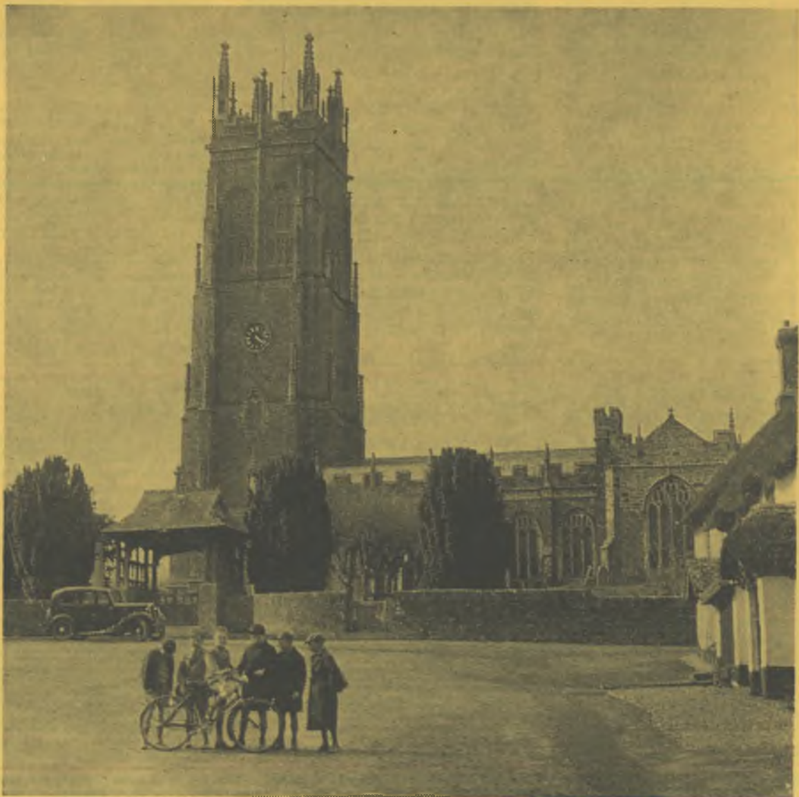
The Church of St. Hieritha, Chittlehampton, Devon