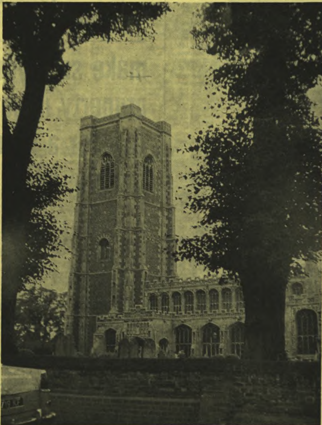
The Church of SS. Peter and Paul, Lavenham, Suffolk