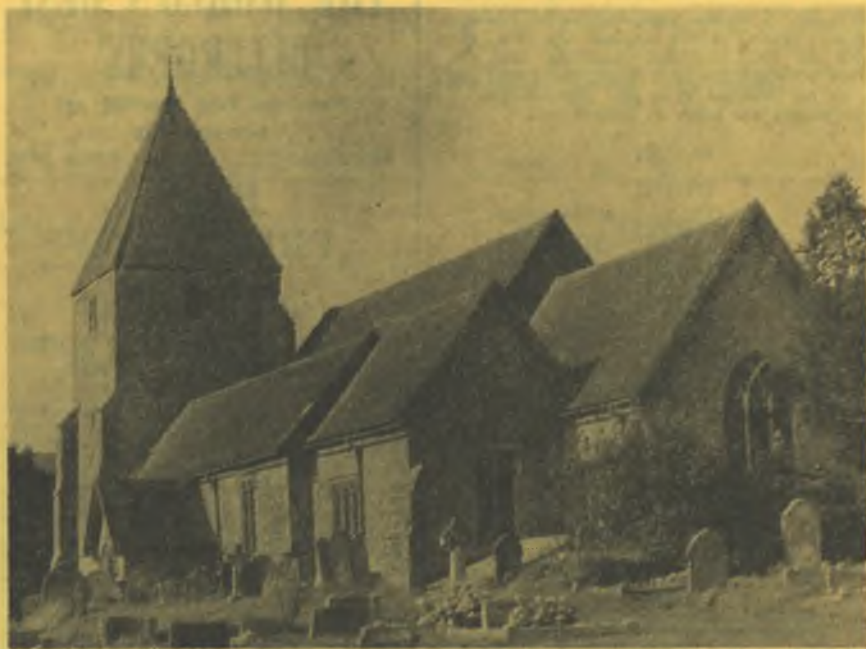
THE CHURCH OF ST. JOHN THE BAPTIST, MERSHAM.