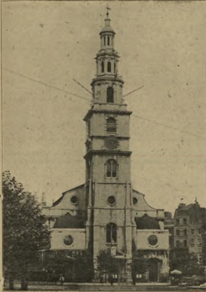
THE CHURCH OF ST. CLEMENT DANES.

This adds another to the sad and growing list of Wren churches destroyed, and unfortunately it includes some of the most important of the works of the great architect, St. Bride's, St. Lawrence Jewry, St. Andrew's, Holborn, and St. Mildred's, Bread Street—it is difficult to find four among those that survive equal in value to these.