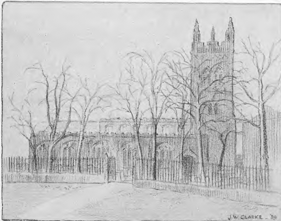
THE CHURCH OF ST. MARY-ON-THE-HILL.

The Church of St. Mary-on-the-Hill, Chester, was probably built in the 12th century, but little is known of its early history except that it was in the possession of the rich abbey of St. Werburgh until the dissolution of 1540. The advowson was then granted to the newly-created Dean and Chapter, but by 1554 it was in the hands of the Brereton family. The churchwardens' accounts, beginning in 1536, enable much of the later history of this church, architecturally the best of its type in the city, to be clearly deduced.