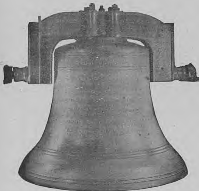
SHERBORNE ABBEY RECAST TENOR. 46 cwt. 0 qr. 5 lb.