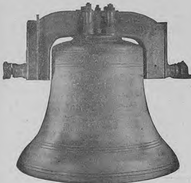
SHERBORNE ABBEY RECAST TENOR. 46 cwt. 0 qr. 5 lb.