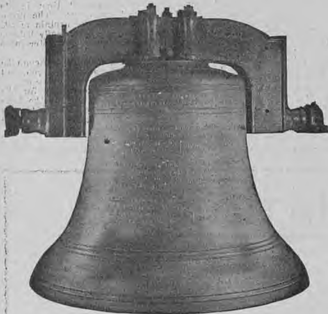
SHERBORNE ABBEY RECAST TENOR. 44 wt. 8 qr. 5 lb.