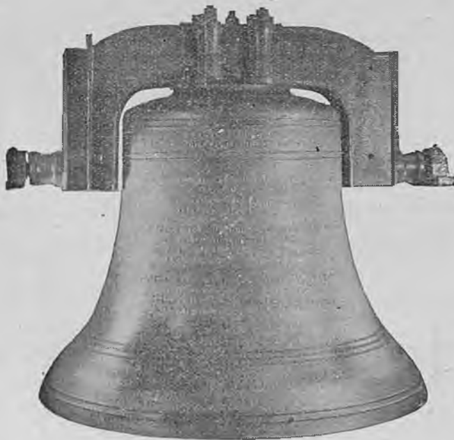
SHERBORNE ABBEY RECAST TENOR.