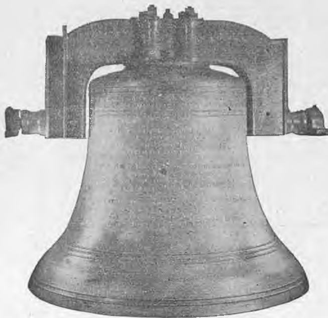
SHERBORNE ABBEY RECAST TENOR.