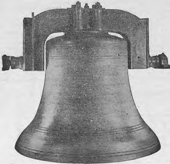
SHERBORNE ABBEY RECAST TENOR. 48 cwt. 0 qr. 5 lb.