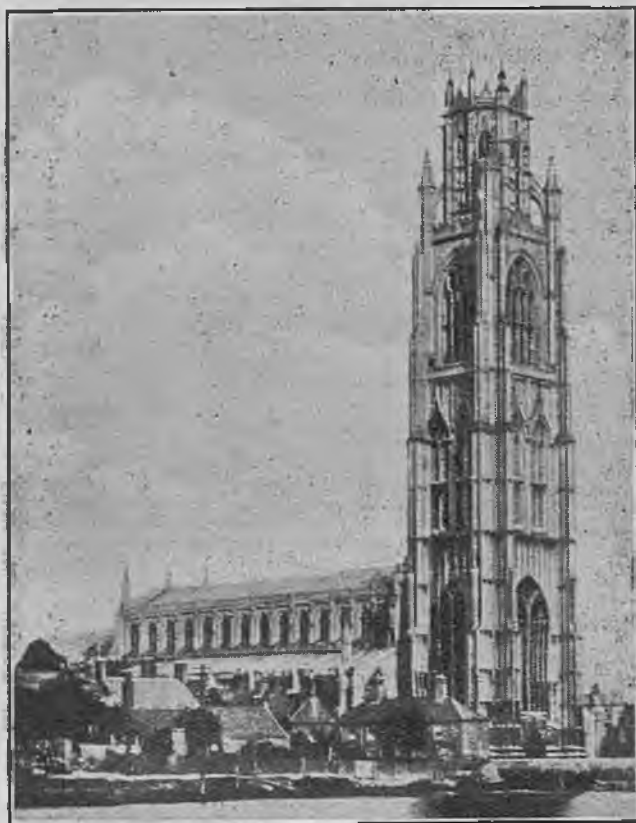
'THE CATHEDRAL OF THE FENS.'

Surfleet is also the home of another celebrity in ringing—another Master of the Lincoln Diocesan Guild, like his Vicar before him, and other things now emanate from Surfleet, which give it some claim to fame. For instance, there are the movies, which depict ringers in real life. These have brought another risk into the lives of those who go up into the towers for ringing. They say that photographs cannot lie. That being the case, there must be many ringers who, having seen themselves on the Surfleet films, have realised they are not all they had previously thought of themselves.