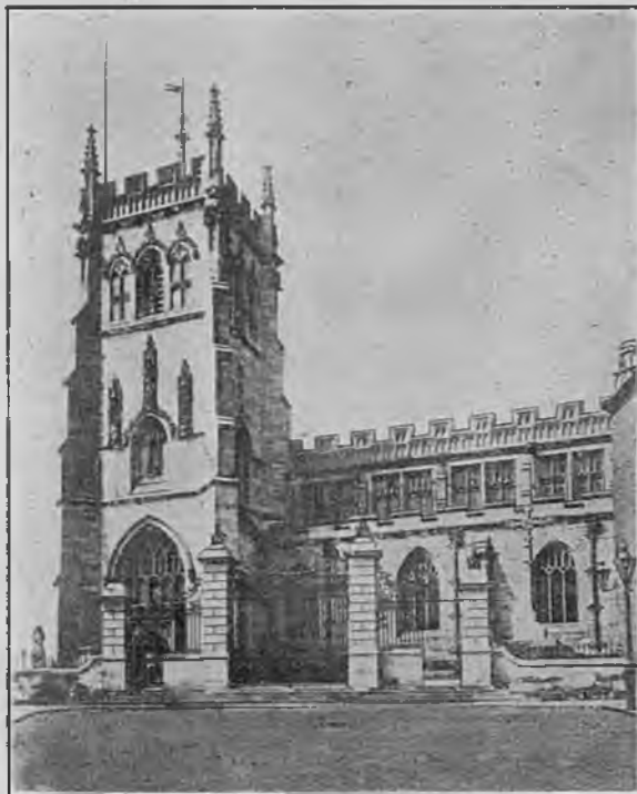
The Church of St. Mary and All Saints, Kidderminster.

York Minster was the first church in which a peal of twelve was installed. These were set up in 1681, but were recast in 1765, and there were not twelve bells in the tower again until 1844. St. Bride's, Fleet Street, London, has been longest in continuous possession of a peal of twelve. They were made into this number in 1719, and it was on them that the first twelve-bell peal was rung in 1724. Cirencester were made twelve in 1722, and then followed St. Martin's-in-the-Fields (1726), S. Michael's, Cornhill (1728), and S. Saviour's, Southwark (1735). After this there was a long break before another ring of