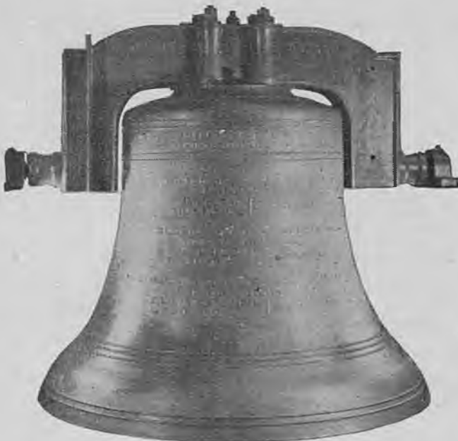
SHERBORNE ABBEY RECAST TENOR. 48 cwt. 0 qr. 5 lb.