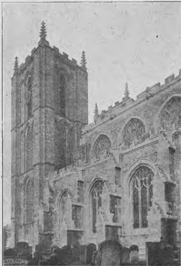
THE BELL TOWER AT RIPON CATHEDRAL.