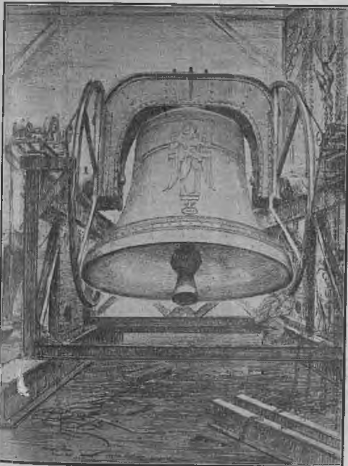
THE 18½ TON RINGING BELL, the Bourdon of the Carillon of 64 Bells, about to be installed at RIVERSIDE CHURCH, NEW YORK, U.S.A.

Telephone: Thornton Heath 1220, 1221 and 2533