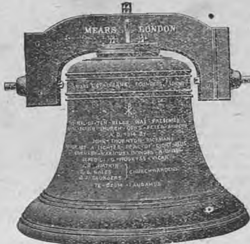
Tenor Bell, 25½ cwt., of the new ring of Ten at St. Peter's, Brighton.