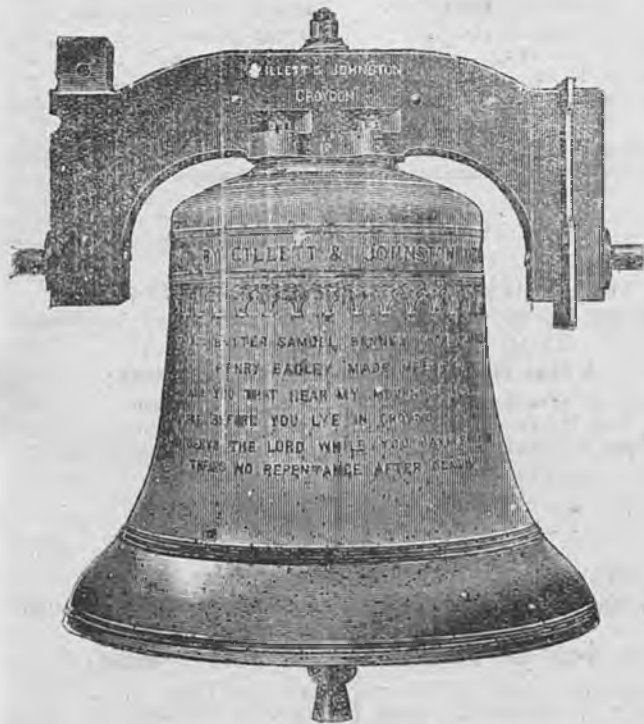
St. Peter's Collegiate Church, Wolverhampton.