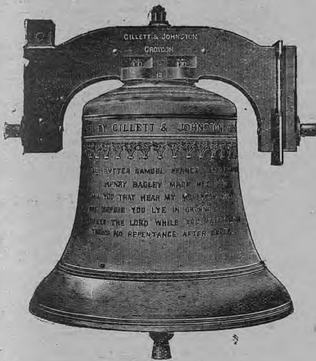
St. Peter's Collegiate Church, Wolverhampton. Tenor (33 cwt.) of the New Ring of 12.

WULFRUN CHAMBERS, WOLVERHAMPTON, MESSRS GILLETT and JOHNSTON, CROYDON, 4th March, 1912. Gentlemen,