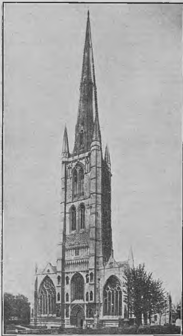
ST. WULFRAM'S, GRANTHAM.

According to Street's "Notes on Grantham" it appears that in 1640 the bells, then five in number, were rehung,