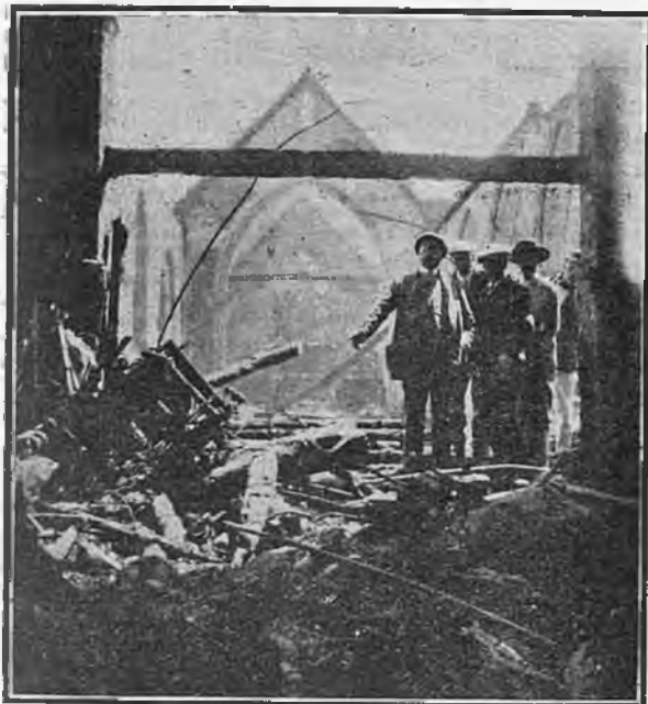
THE RUINS AT WARGRAVE.

The accompanying pictures vividly illustrate the devastation caused, it is believed, by suffragettes at Breadsall (Derbyshire) and Wargrave (Berks) Churches. In each