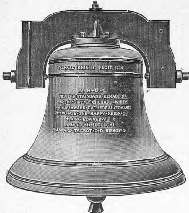
THE TENOR BELL, SOUTHWARK CATHEDRAL, Weight, 50 cwt, 0 qr. 21 lbs.

Bellfounders & Bellhangers, 32 & 34, Whitechapel Road, LONDON, E.