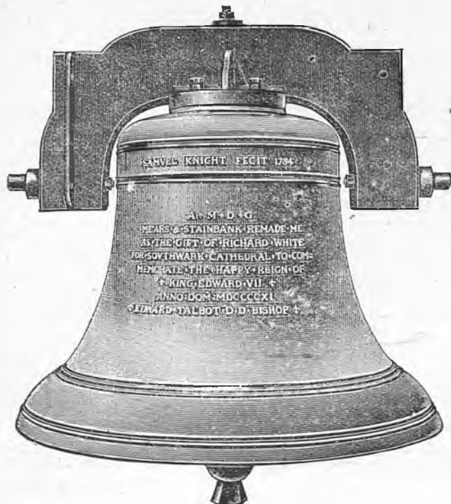
THE TENOR BELL, SOUTHWARK CATHEDRAL, Weight, 50 cwt. 0 qr. 21 lbs.

Bellfounders & Bellhangers, 32 & 34, Whitechapel Road, LONDON, E.