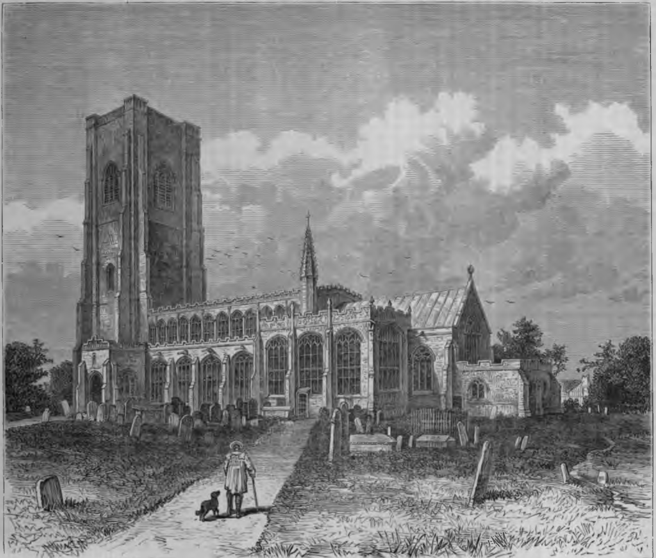
S.S. PETER AND PAUL, LAVENHAM, SUFFOLK.