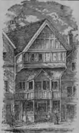
Ye Olde House, A.D. 1730.

MUSICAL HANDBELLS tuned in Diatonic and Chromatic Scales, in sets of any numbers.