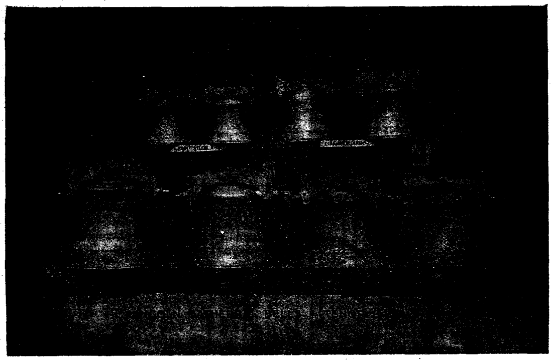
FOUNDERS of the Ring of Bells for Sr. PAUL'S CATHEDRAL the Heaviest Peal of 12 Ringing Bells in the World

This is unquestionably the grandest ringing peal in England, and therefore in the world," The late Lord Grimthorpe, K.C. —Times, Nov. 20, 1878.