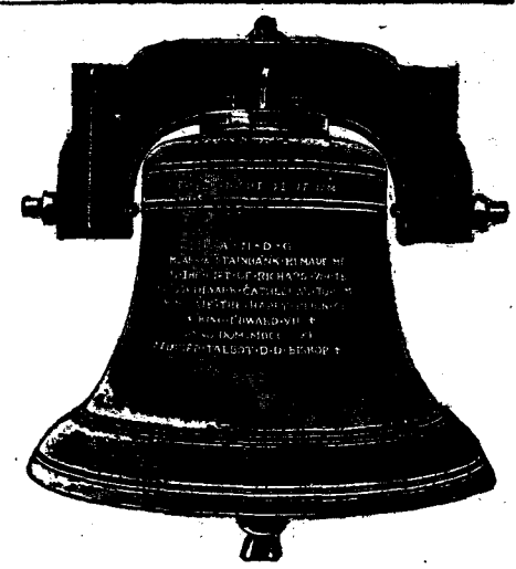
Southwark Cathedral Tenor, 50 cwt.